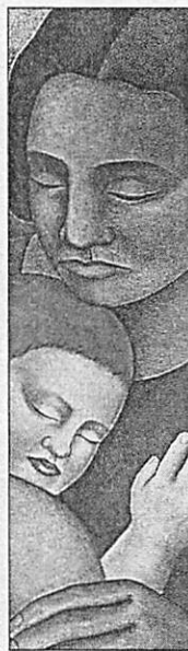
SANDRA DIONISI/STOCK ILLUSTRATION SOURCE

Whatever the validity of these statistics, political and legislative efforts to end child abuse have focused disproportionately on sexual abuse — specifically on sexual abuse by strangers. More than 85 percent of public schools have government-funded programs to teach children to stave off sexual advances,