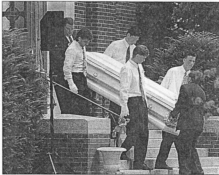
Megan's Law began with rape and murder by a convicted molester.